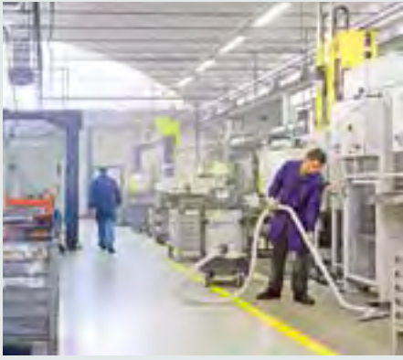
Cleaning of a metal company