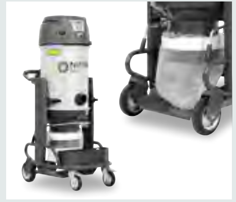
S3 with gravity unload system with Longopac®