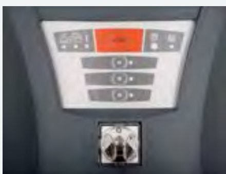
Electronic board control