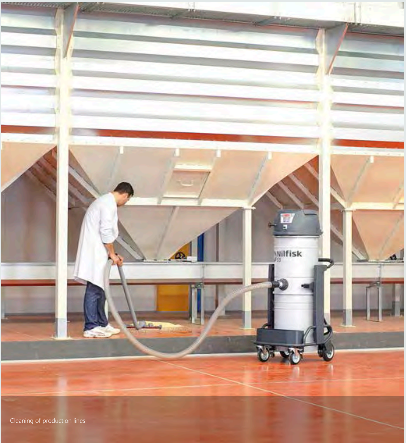
Cleaning of production lines