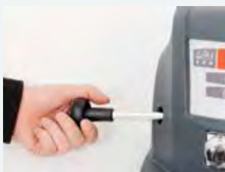
Manual filter shaker