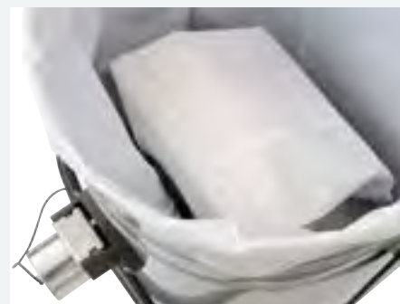
Safe bag for toxic material