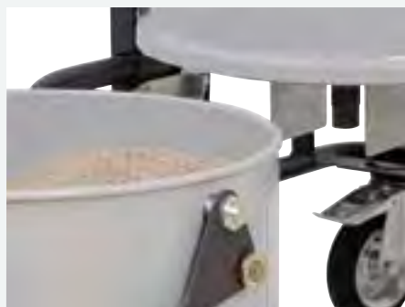
Solid cut-off system